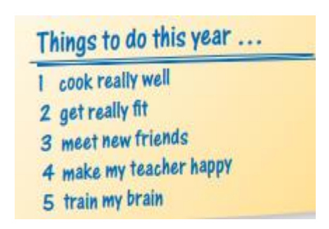
Activity 3: Look at ideas 1-5. Take turns giving and responding to advice for each situation.

WEEK 21 - PERIOD: 63 LESSON 9: WRITING (tiết 1) * A biographical web page